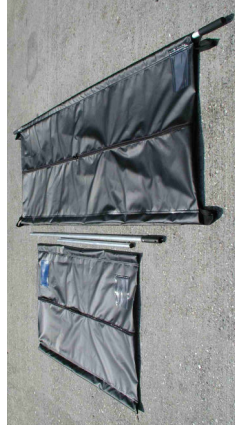
Carry handles 3 off each side

When split \frac{3}{4} & \frac{1}{4} the \frac{3}{4} length can be used with a smaller body bag 1.5m (5ft) long.