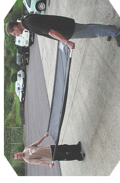
Grip Handles – each side